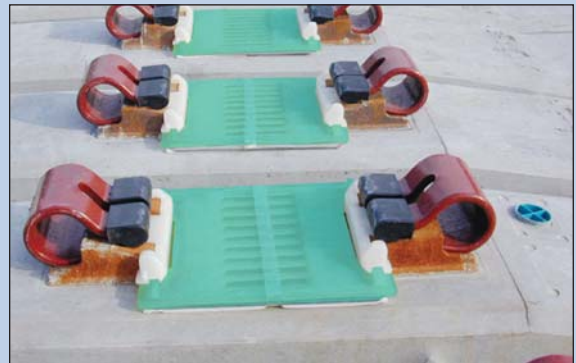
SAFELOK III components in the factory installed or "rail-ready" position.