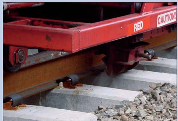
Fast, mechanized application of SAFELOK III