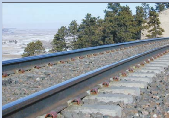
Completed SAFELOK III track