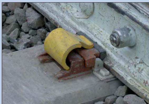
SAFELOK III on a joint bar