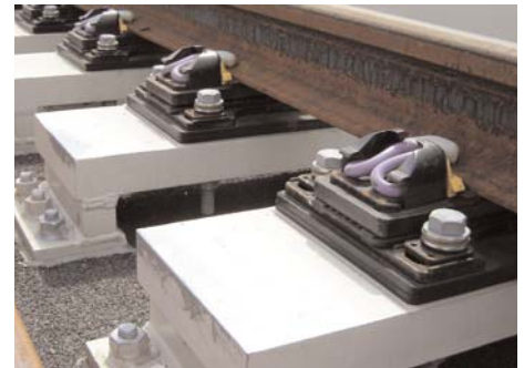
PANDROL VIPA-SP baseplates installed on a steel deck bridge